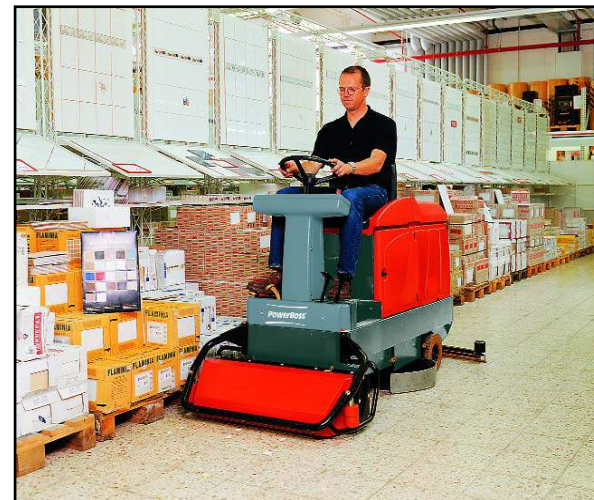
With pre-sweep and tool: Pre-sweeping and scrubbing in one operation, additional scrubbing and vacuuming tool for edges and corners.