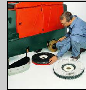
Brushes: Brushes and pads can be changed in a flash without the use of tools.