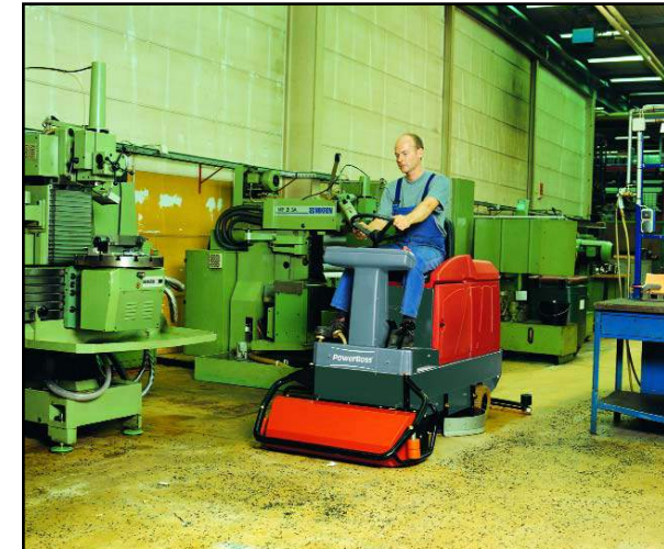
Admiral 35: For perfect maintenance or basic cleaning. Highly maneuverable, compact, easy, light handling, powerful and efficient.