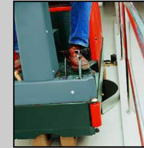
Working close to the edge: Poses no problem with protruding brushes and suspended squeegee.