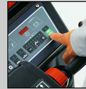
Operating panel: All cleaning functions can be started simultaneously. Quick and easy.