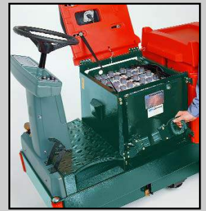
Batteries: Battery system easy to access with quick exchange device (optional equipment).