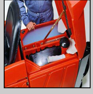
Tank: Large flexible wall tank, 37 gallons. Outlet hoses with dosage device for quick emptying.