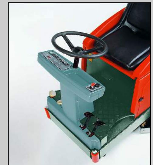
Operator compartment: The operator can access the driver's seat from both sides with an excellent view of the area to be cleaned. All operating elements are in direct view and easy reach of the operator. Adjustable, comfortable driver's seat.