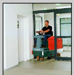
Compact and maneuverable: Fits through any standard door. Minimum passing width of 27in.