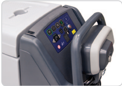
A wrap-around safe paddle system makes it easier to control and maneuver the machine.