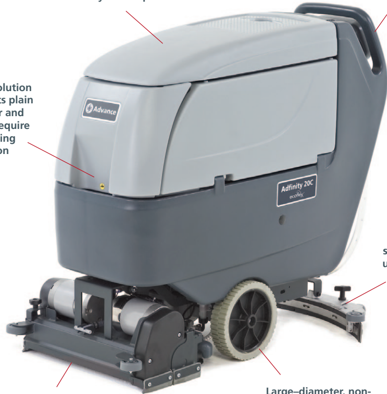
Center-pivot squeegee picks up 100% water on turns