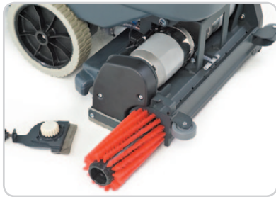
Tools-free removable brushes can be easily changed.