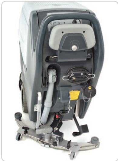
Easy access rear-port features include the solution tank fill, a large recovery drain hose with pinch-flow regulation, and the solution drain hose which also functions as a solution level indicator.