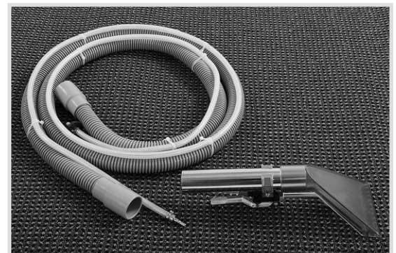
8 foot hose and clear hand tool.