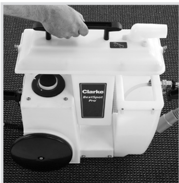
Recovery tank conveniently empties and can be rinsed.

The BEXTSpot Pro® provides a compact, lightweight highly portable tool for quick carpet or upholstery spot clean-up. With a 1 gallon tank, there is plenty of solution capacity for the emergency small jobs that present themselves in schools, offices, food service areas or healthcare facilities. With a powerful pump and vacuum motor, this very convenient machine gets the job done fast, and can then be stored away out of sight.