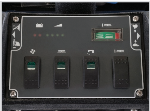
Easily-adjustable traction drive and pad pressure.

Featuring variable speed control and pad pressure, as well as forward/reverse motion, the monstrous Clarke CA90™ 32T can cover over 34,560 square feet per hour and apply up to 200 pounds of down pressure. On top of that, its easy-to-use fingertip controls make it simple and intuitive even for new operators. The CA90™ 32T has a productive 32 inch cleaning path that makes it an ideal solution for large environments that require regular, aggressive cleaning such as schools, malls, hospitals, airports, hotels and more.