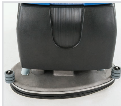
32 inch wide cleaning path.