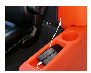
Always reachable: Thanks to the USB socket for mobile phones (standard equipment).