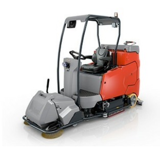
Additional safety: Equipping the machine with the optional overhead guard protects the driver against falling objects at any time, which is particularly important for applications in the logistics industry.