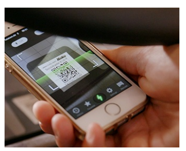
Service via code scanning: The QR code below the steering wheel allows access to all relevant machine data and other details – even transmitting service requests directly there and then.