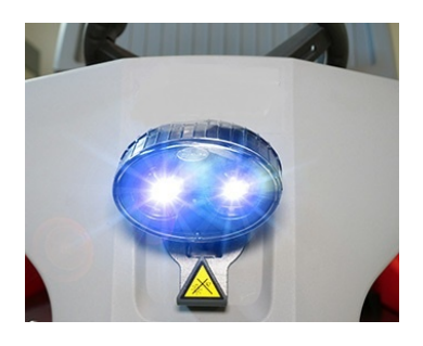
Increased safety in aisles: The BlueSpot head lamp signals an oncoming vehicle.