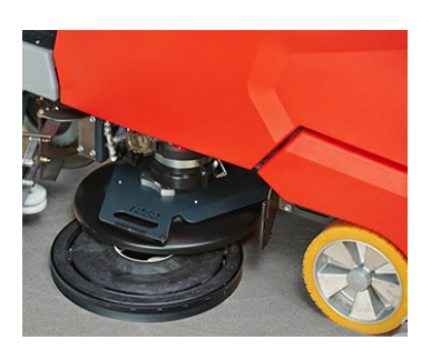
Rapid brush changing: The automatic discharge and pickup system provides rapid and comfortable changing of the brushes.