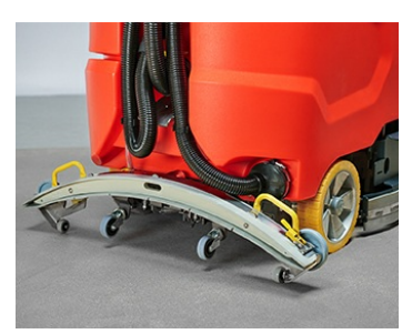
Practical feature: The squeegee folds up manually to facilitate daily cleaning and maintenance.