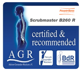
Superior comfort: The Scrubmaster B260 R has been awarded the AGR quality label for its overall ergonomic machine concept.