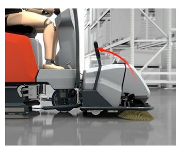
Superior cleaning results in a single working step: The optional, easy-to-install pre-sweep/vacuum unit removes loose dirt prior to wetcleaning the floor.