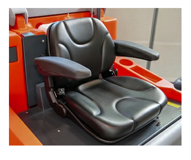
Comfortable workplace: The ergonomic seat, which can be accessed from both sides of the machine, ensures a back-friendly sitting posture.