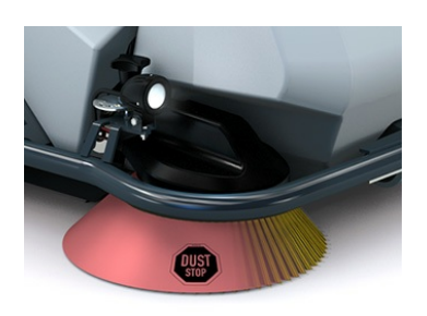
Dust-free cleaning: The optional pre-sweep/vacuum unit can be equipped with Dust Stop – our disc brush jacket providing dust-free sweeping & vacuuming.