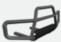
Bumper Guard with/wout Lights