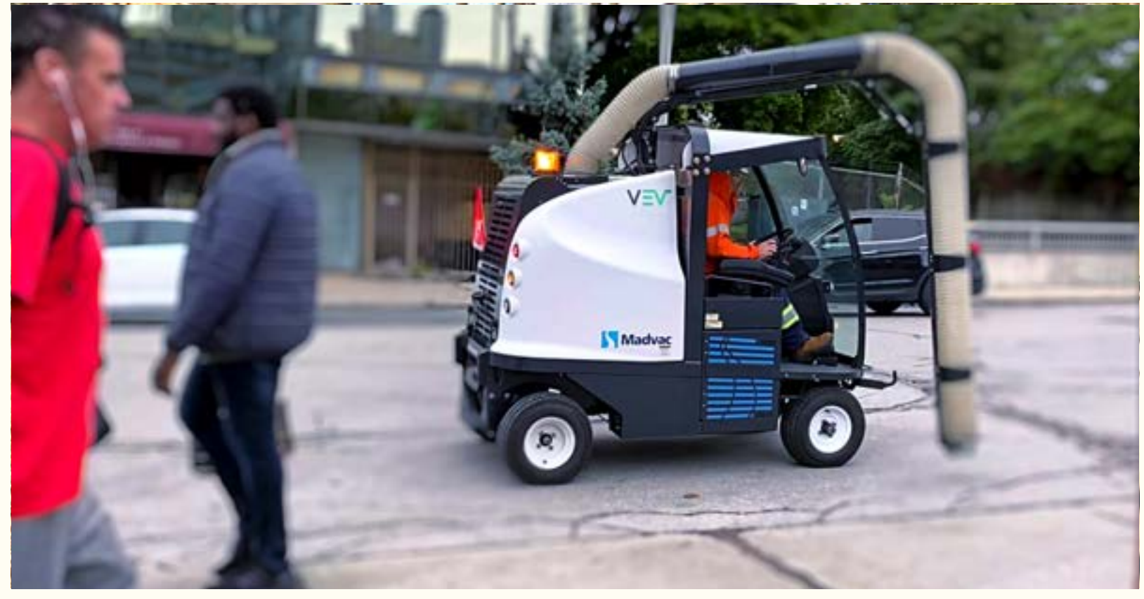
Technical specs are subject to change without prior notice